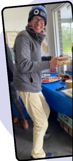
Our wonderful catering staff, (and a cake thief!)