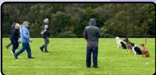
And the action on the ground