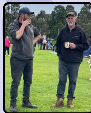
The ground crew